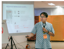
INTRODUCTION OF KAIZEN AND VALUE STREAM