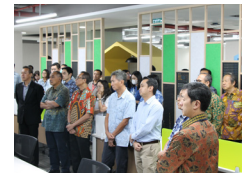
DIRECT OBSERVATION IN THE WORKPLACE