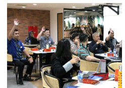
SHARING KNOWLEDGE AMONG COMPANIES