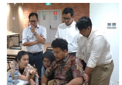
KAIZEN RESULTS ANALYSIS