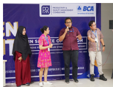
MAKING A MINI COMPANY