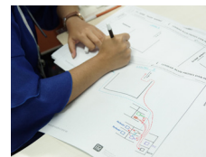
KAIZEN RESULTS STANDARDIZATION