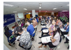
SHARING KNOWLEDGE AMONG COMPANIES