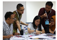
KAIZEN RESULTS ANALYSIS