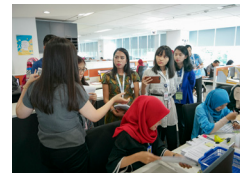
DIRECT OBSERVASI IN THE WORKPLACE