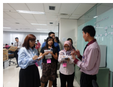
MAKING A MINI COMPANY